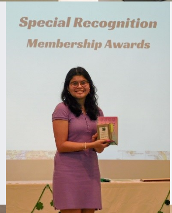
Special Recognition Membership Awards